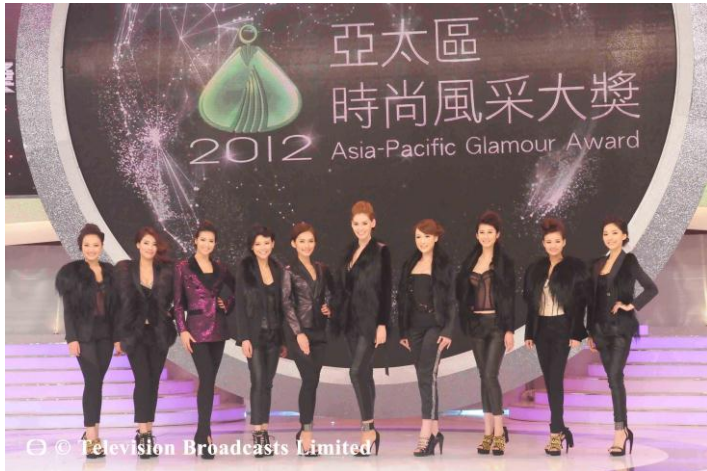
4. (From left to right) Delegates No.1-10 from Asia-Pacific Region

Tel : (852) 2335 3333 Fax: (852) 2358 3227 E-mail: info@tvbihk.com