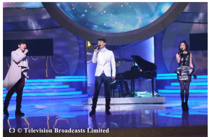
3f Performing guests: Hacken Lee, Alfred Hui and Mag Lam