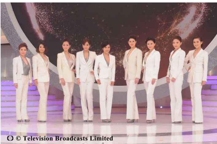
8. (From left to right) Delegates No. 20-26 from Greater China Region