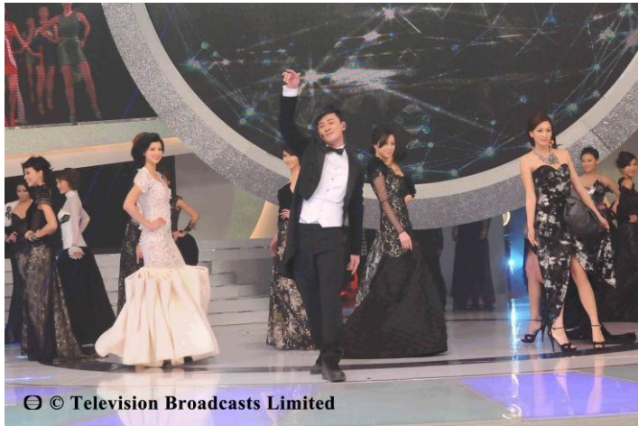
3a Performing guest: Raymond Lam

Tel : (852) 2335 3333 Fax: (852) 2358 3227 E-mail: info@tvbihk.com